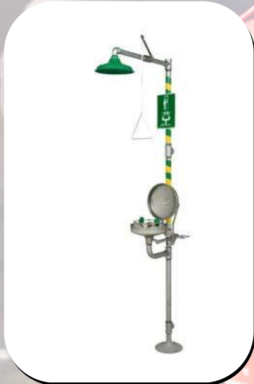
Haws 8346 AXION MSR Combination Drench Shower & Feather-Flo Eye/Face Wash