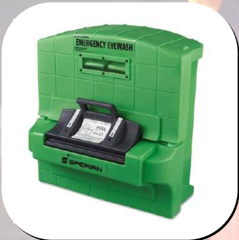
SPERIAN Fendall Pure Flow 1000