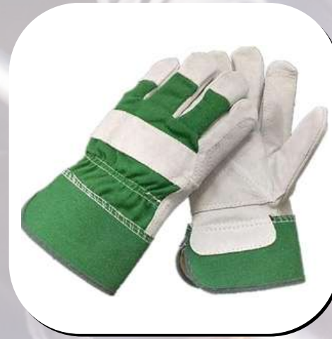
Green Color 10"