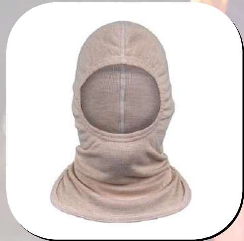
Cobra Firefighting Hood