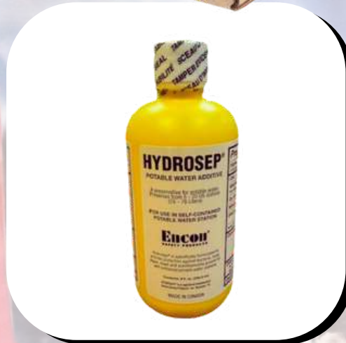
Encon 01045001 Wall Mount Eye/Facewash