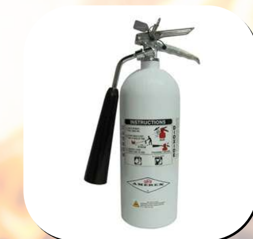
CO2 5 lb 322NM (Nonmagnetic)