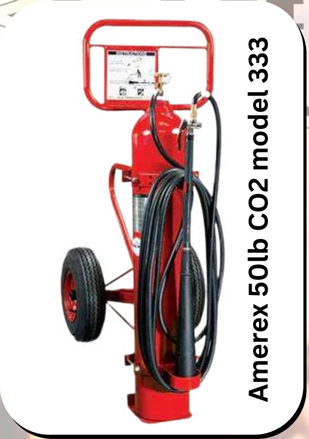
Amerex 50lb CO2 model 333