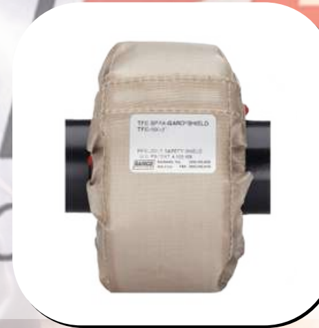
TFE SPRA-GARD® - Size: 4" Flanges Corrosion Protection