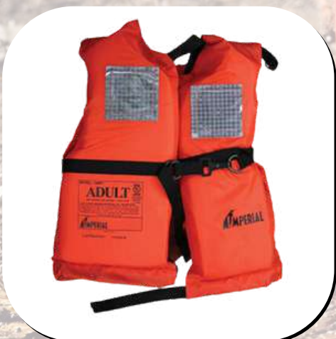
LIFE PRESERVER 198RT