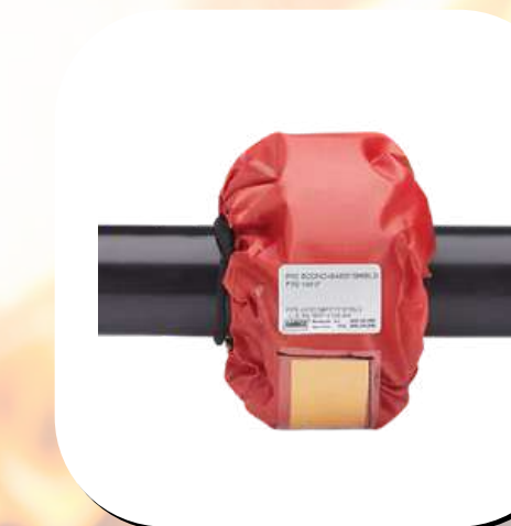
PVCR 300 - 8" Econo Gard