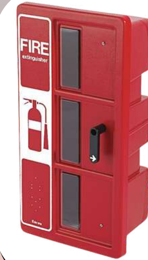
Encon 01337002 Fire Extinguisher Wall Case