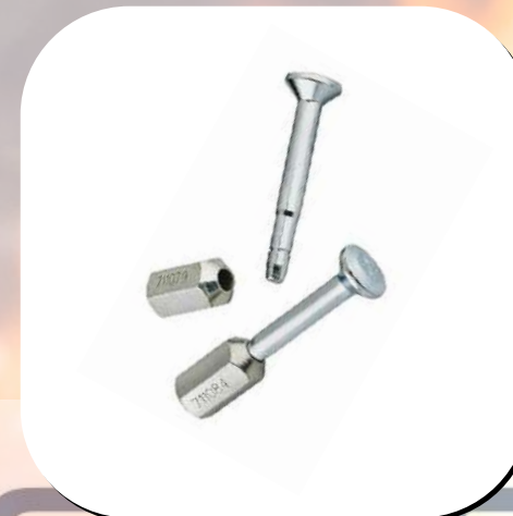
STEEL BOLT SEAL