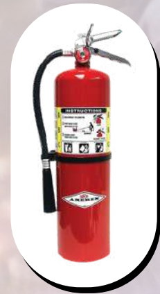
20lb ABC model A411