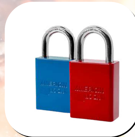
AmericanLock A1105 RED