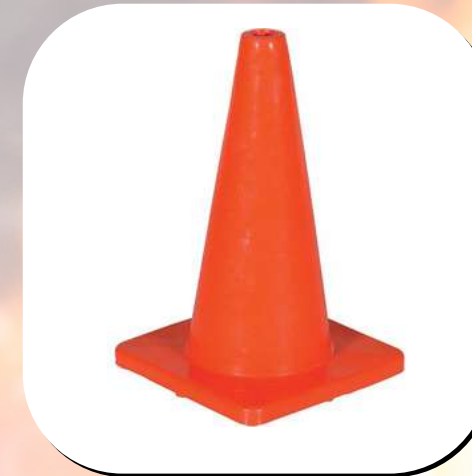
Traffic Cones - Orange