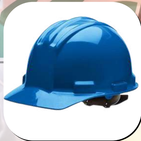
Bullard 51 BLUE