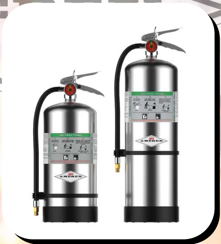
Class K Fire Extinguishers Wet Chemical