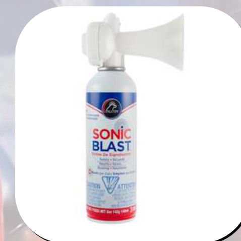
Falcon Safety FSB5BU