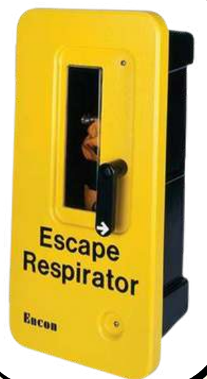
ENCON 01339101 ESCBA Wall Case