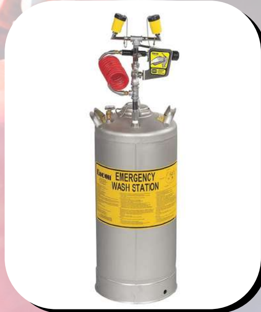
ENCON 01104002 EYEWASH Portable 13 GAL