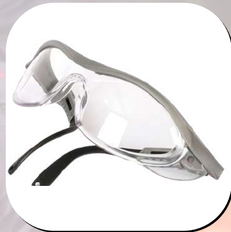
Eyevex SSP 541