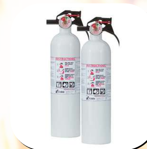
Fire Extinguisher 466627MTL