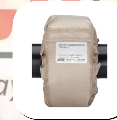
TFE SPRA-GARD® - Size: 8" Flanges Corrosion Protection