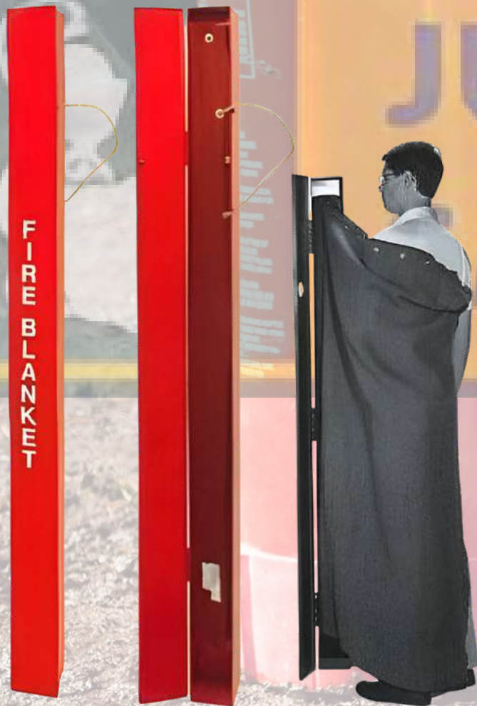
Fire Blamket JSA-1010