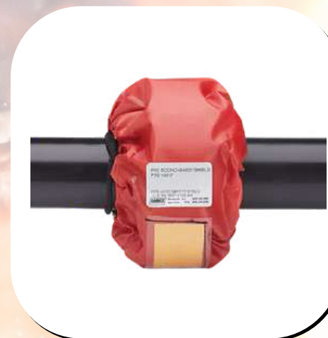
PVCR 300 - 2" Econo Gard