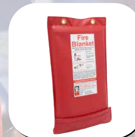
Fire Blanket Bridela 1.8m x 1.8m