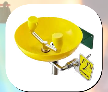
SE-580 Wall mounted Eyewash