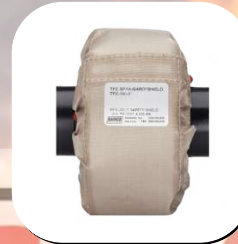
TFE SPRA-GARD® - Size: 1" Flanges Corrosion Protection