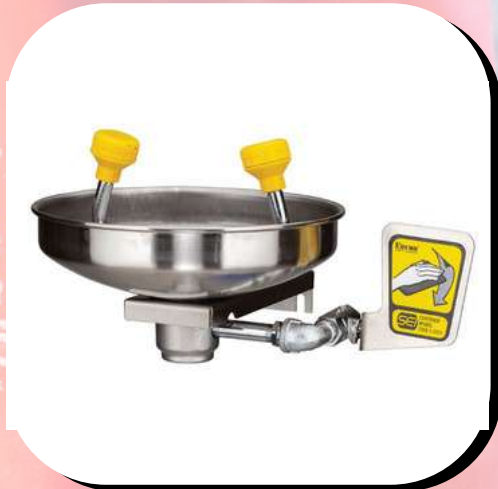
Encon 01045001 Wall Mount Eye/Facewash