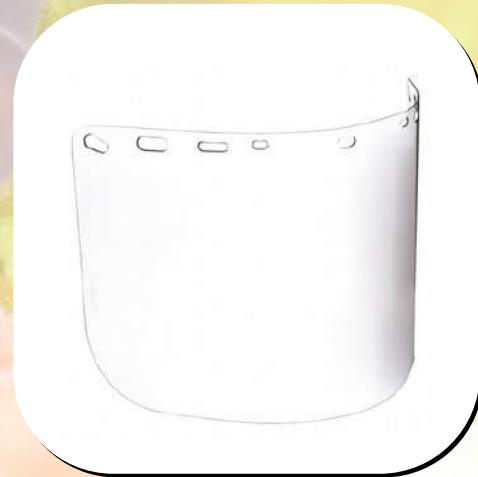
Bullard 840P Face Shield