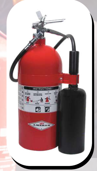
10lbs CO2 model 330