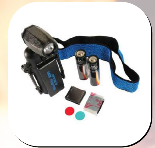
Flashlight Pelican 2250