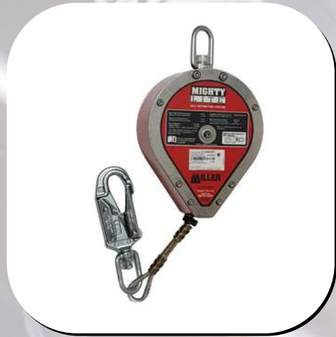
Miller Lifeline RLS30BS/30ft