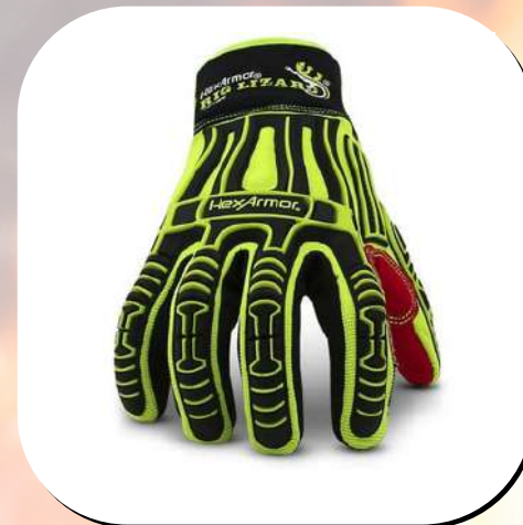
Rig Lizard™ 2021