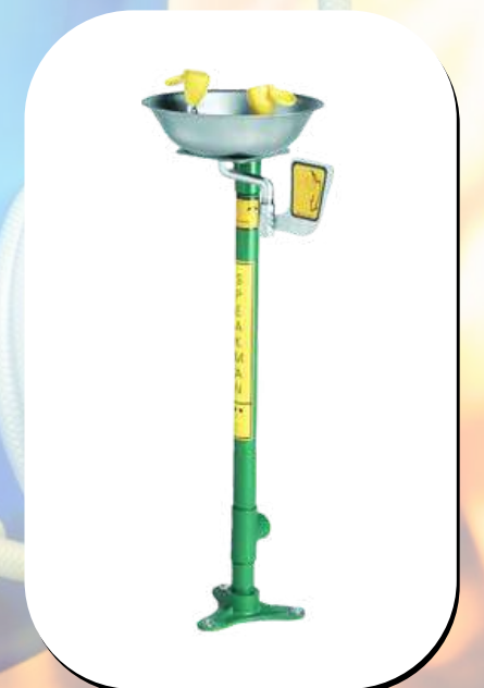
Speakman Select Series SE-420