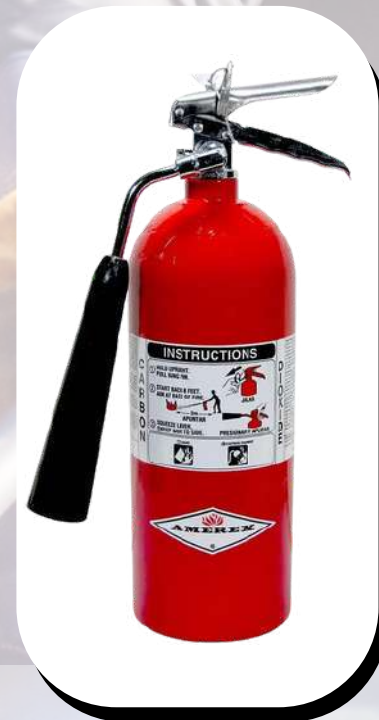
5lbs CO2 model 322