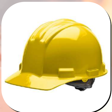
Bullard 51 YELLOW