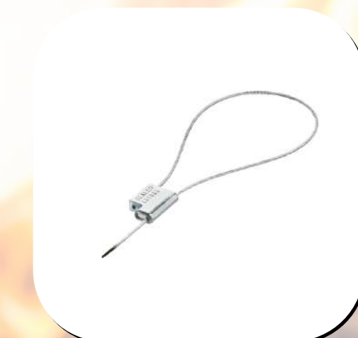
Car Seals CL-99-14

ACM SEALS.COM AMERICAN CASTING & MANUFACTURING