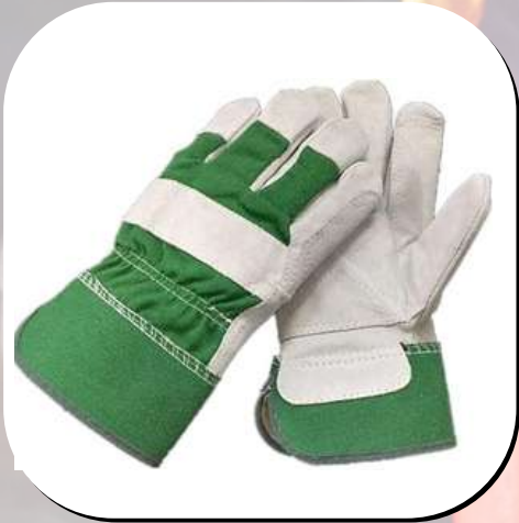
Green Color 12"