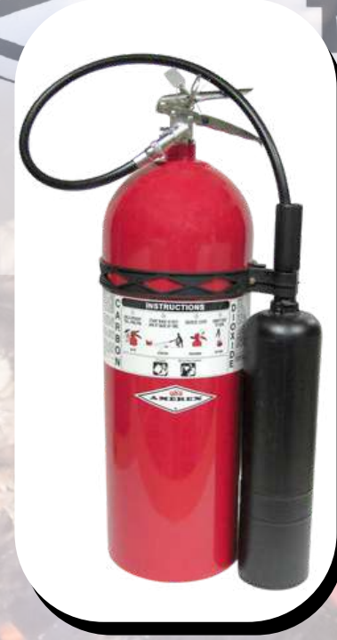
15lbs CO2 model 332

We are delighted to share that As-Shaibi Trading is now a direct distributor of Amerex Fire Extinguishers, renowned for their excellence in fire safety. Amerex, a brand synonymous with cutting-edge technology and superior quality, is UL listed and ARAMCO approved. As a trusted partner of Amerex, we procure directly from their comprehensive range of fire extinguishers, ensuring that our customers in Saudi Arabia have access to top-tier safety solutions. Amerex Fire Extinguishers, with their UL listing and ARAMCO approval, stand as a testament to reliability and effectiveness, meeting the highest industry standards. At As-Shaibi Trading, our commitment to safety is unwavering. By collaborating with Amerex, we not only strengthen our position as a leading supplier of fire and industrial safety equipment in the region but also assure our customers of the highest standards in fire protection.