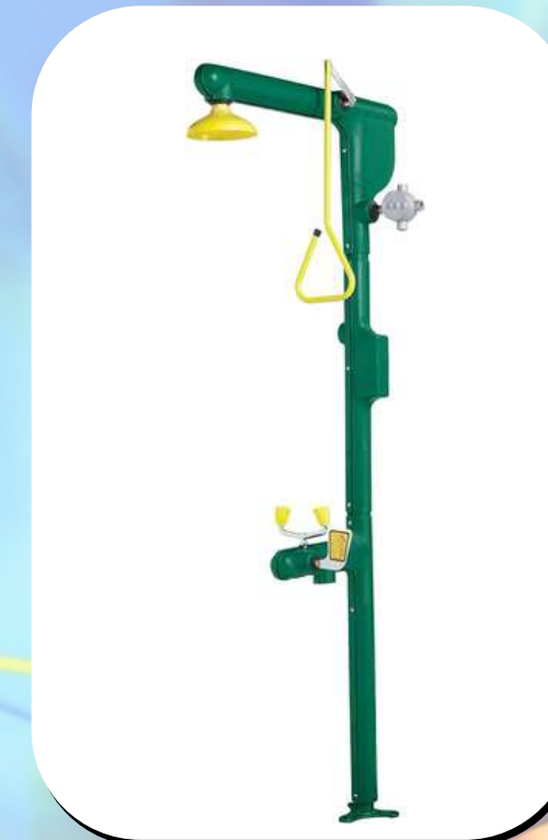
SE-7001 Heat Traced Combination Emergency Shower & Eye/face Wash