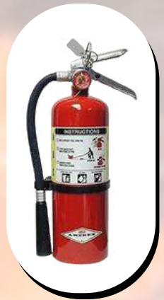
5lb ABC model B500