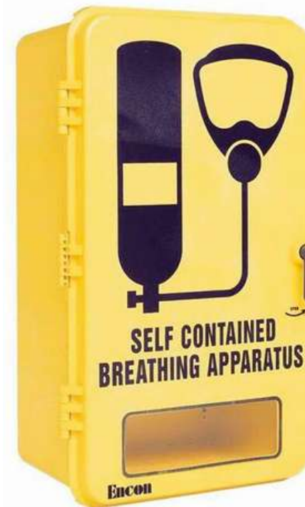
SCBA Wall Case WC22Y10B