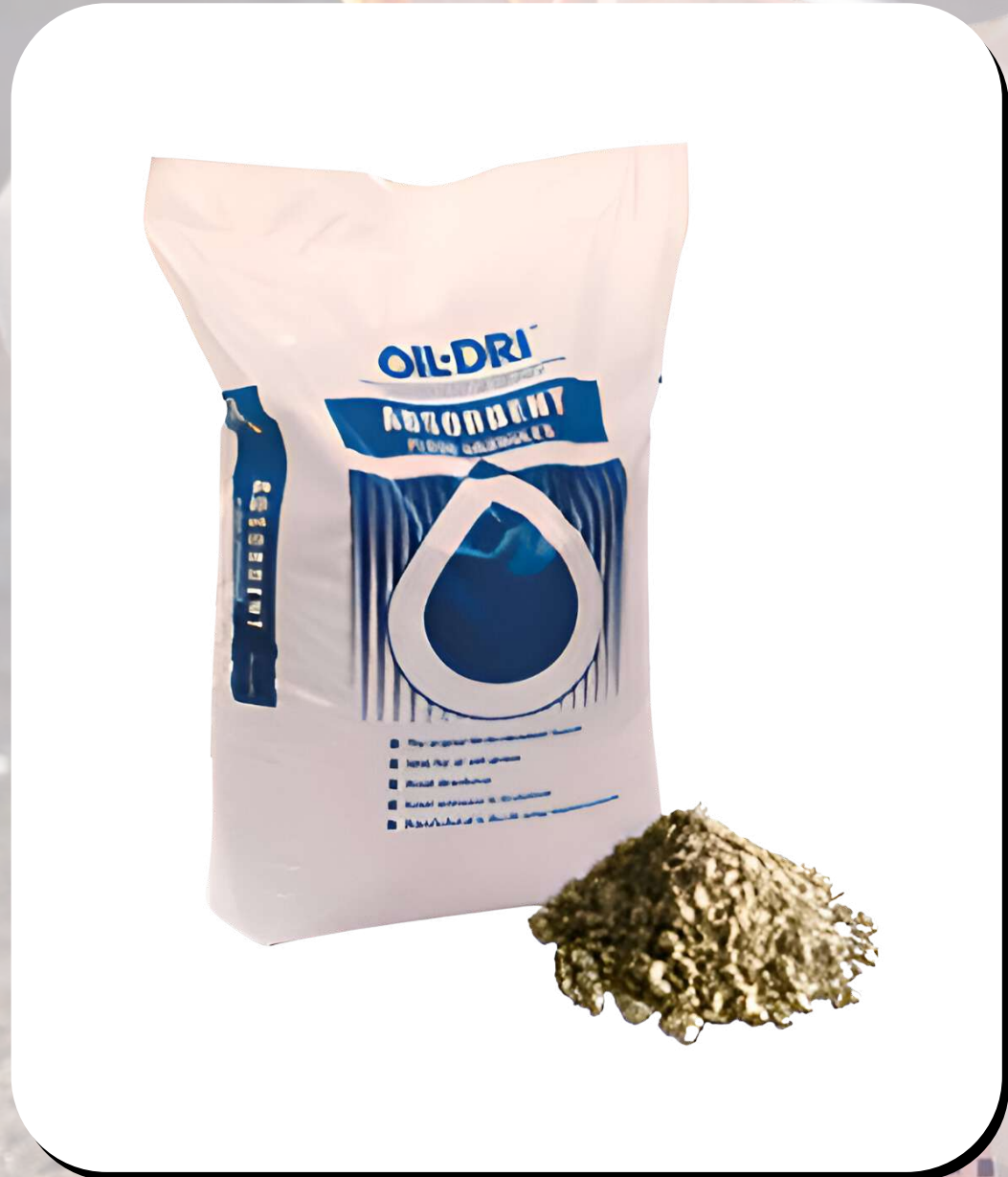
Oil-Dri Absorbent™ CODE: UK406L

Oil-Dri Absorbent™ CODE: UK406L CHEMICAL, PROCESS OIL CHEMICAL, PROCESS OIL: PHYSICAL FORM CRYSTAL, CONTAINER TYPE BAG, CONTAINER CAPACITY 16KG BAGS, Oil-Dri Absorbent™ CODE: UK406L