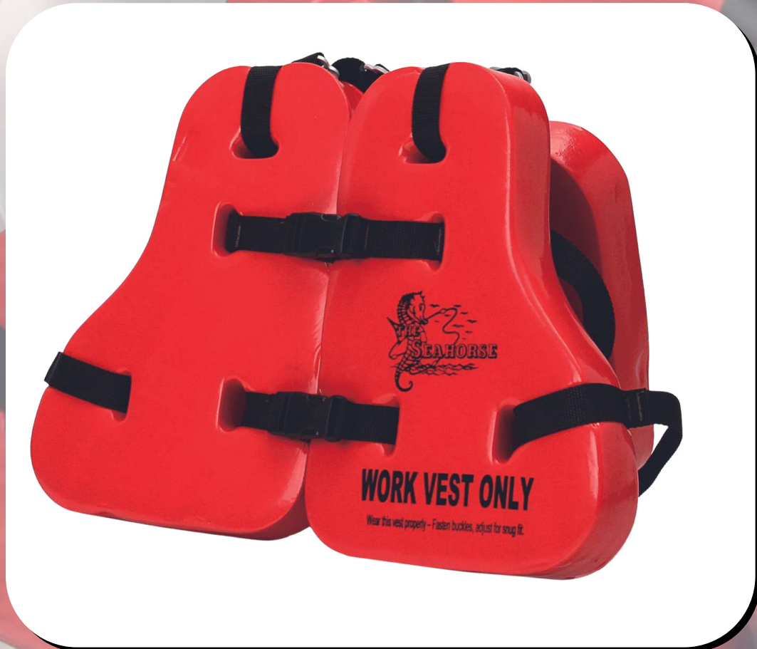
SEA-HORSE PPE – WV-10RT VEST

Seahorse Life Jackets are extremely durable, with only the best components used to ensure long service life. If the closed-cell flotation foam becomes broken or perforated, it will not absorb water. The durable, flexible vinyl coating is resistant to caustics, acids, UV radiation, hydrocarbons, mildew, fading, drilling mud, splits, and abrasions, and it is easy to clean with soap and water, something that fabric-covered devices lack. This bright global orange coating has passed the UL1123 flame test. The webbing framework, not the foam padding, is designed to endure stress and pressure. Comfort: The flexible foam flotation cushions cover a limited area of the body, allowing for better ventilation and movement. This suggests that a Taylortec WV-10 wearer can work more effectively.