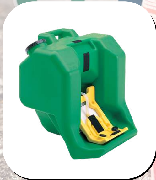
Haws 7500 PORTABLE EYEWASH