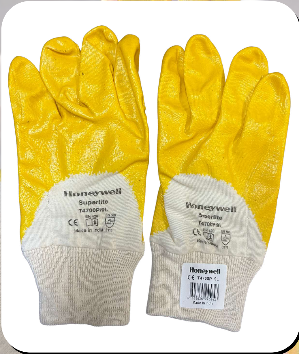
Honeywell Superlite T4700p

COMFORT The glove's nitrile composition was chosen to provide unparalleled dexterity and increased flexibility. While adding comfort and strengthening the glove's mechanical performance, the cotton interlock inside absorbs perspiration from the hands. The glove is more breathable thanks to its vented back. Good wrist support is given by the cuff's ribs, reducing the chance of becoming caught. RESISTANCE IN THINGS Excellent mechanical (abrasion) and chemical qualities are guaranteed by the nitrile coating. The glove has exceptional abrasion resistance because to its combination base and covering. It works especially well when treating oils, greases, and byproducts made of hydrocarbons.