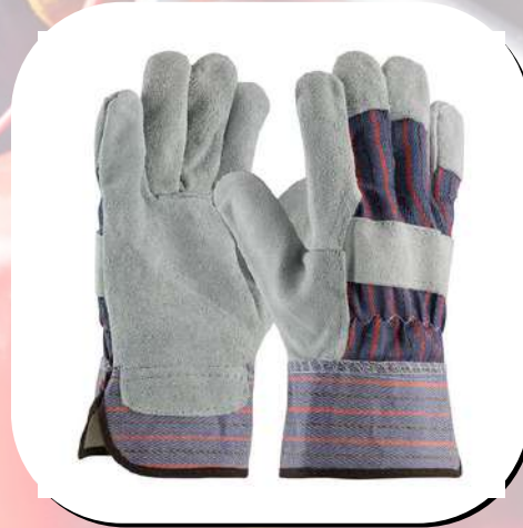
Purple Color 10"