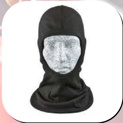
Cobra Hood 3029298