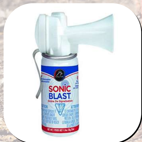
Sonic Blast FSB1