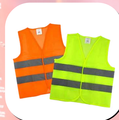
Safety Vest Reflective