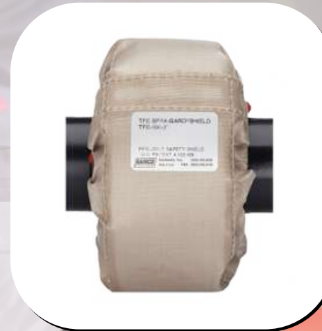
TFE SPRA-GARD® - Size: 3/4" Flanges Corrosion Protection