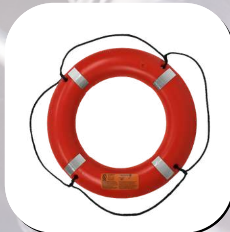
30" DECKBUOY® DX0325D