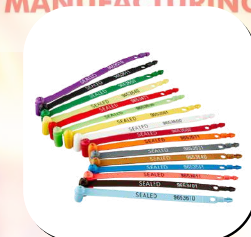
Plastic Seal 4001