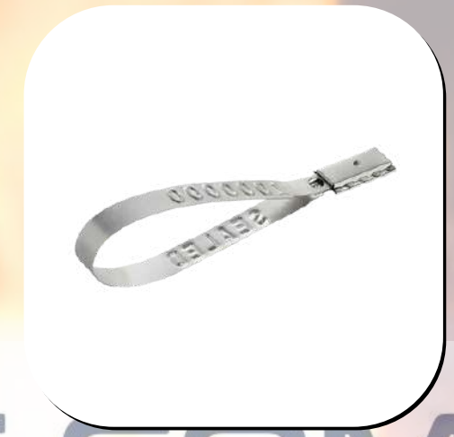
FLAT METAL CAR SEALS