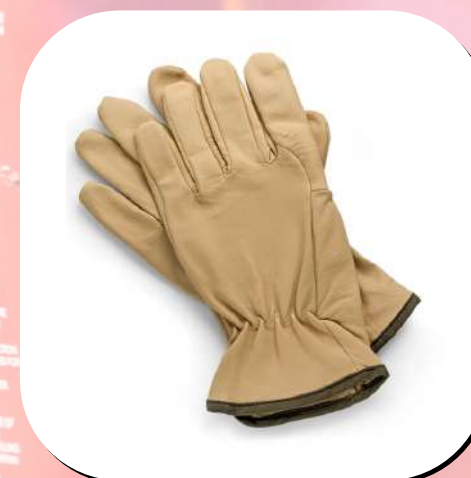
Driver Leather Gloves Beige