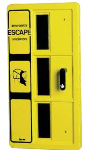
ENCON 01336001 Utility Respiratory Wall Case

Encon Safety products, a well regarded leader in dependable and innovative products to safeguard people and offer emergency personal treatment, has 60 years of expertise manufacturing high-quality safety and protection equipment. The ISO 9001:2008 Standard has been certified for Encon®.