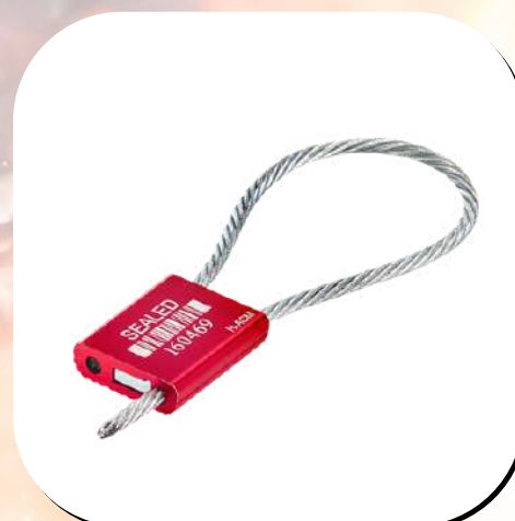
4 MM BARCODED CABLE SEAL