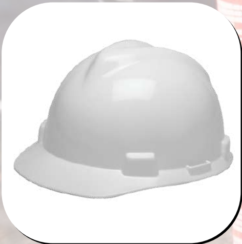
MSA Hard Hat P/N 475358