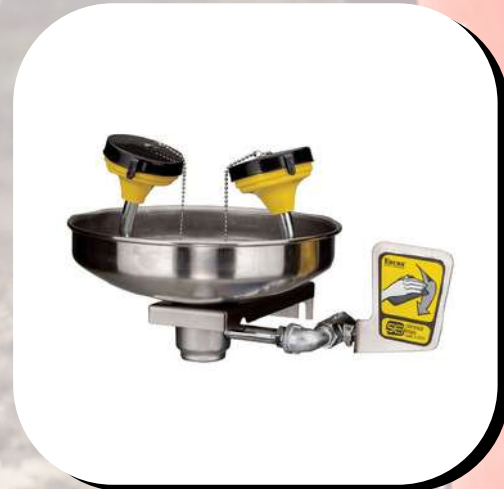
Encon 01045501 Wall Mount Eye/Facewash