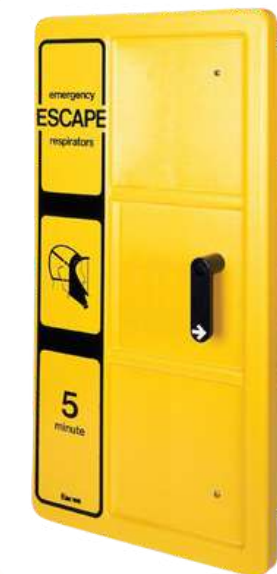
Encon 01337002 Fire Extinguisher Wall Case