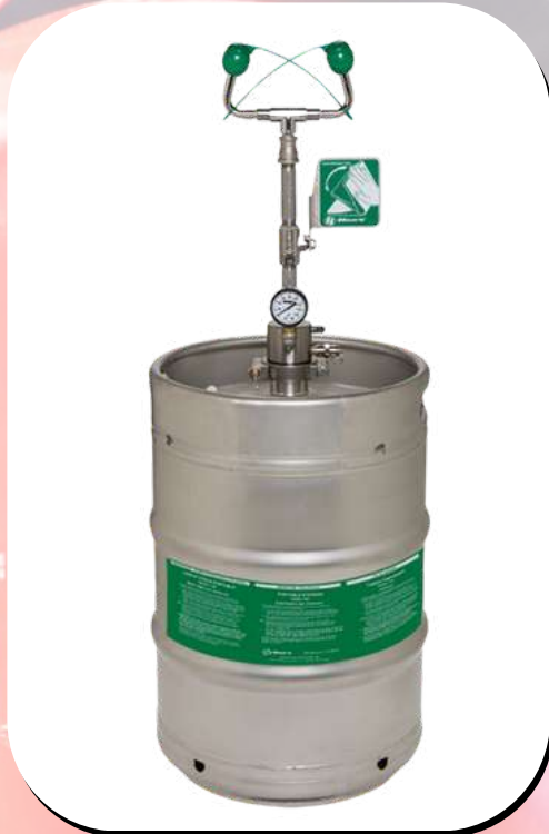
Haws 7603 PORTABLE EYEWASH AIR-PRESSURIZED EMERGENCY