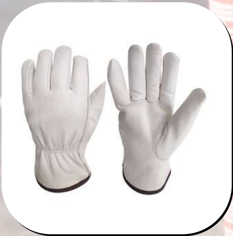
Driver Leather Gloves Grey