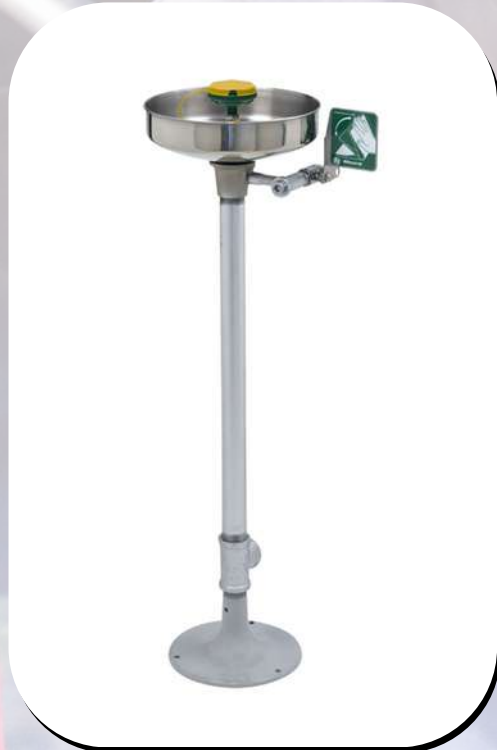
Haws 7361-7461 - AXION® MSR Pedestal Mount Eye/Face Wash