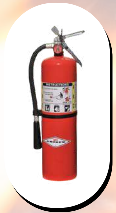
10lb ABC model B456