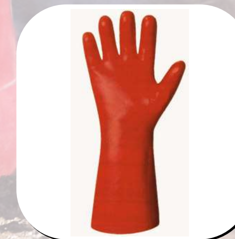
PVC VINLYL COATED