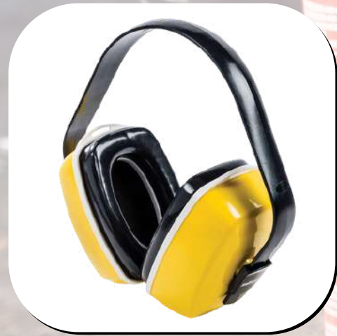
Sellstrom Tonedown 200