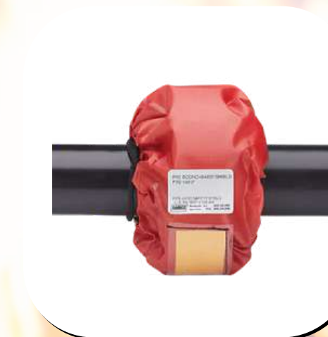
PVCR 300 - 3" Econo Gard