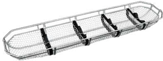
Stretcher JSA-300 CS