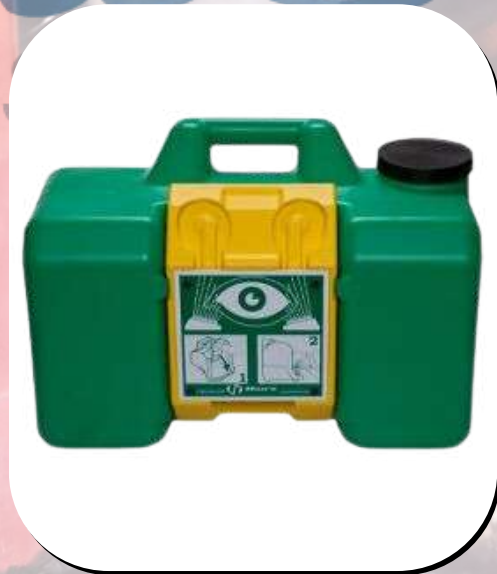
Haws Haws 7501