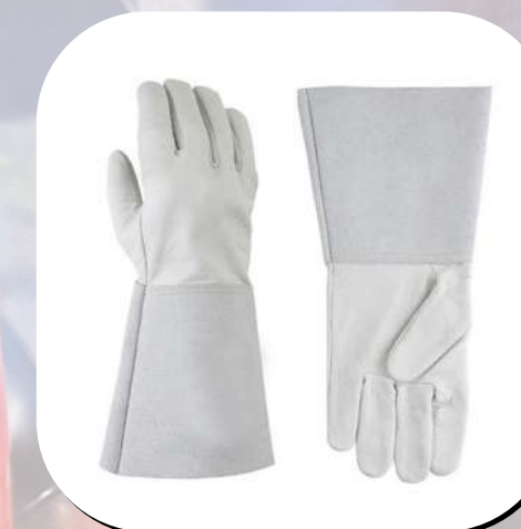
Tig Welding Gloves