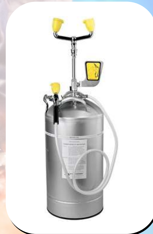
SE-590 10-gallon Portable Eyewash