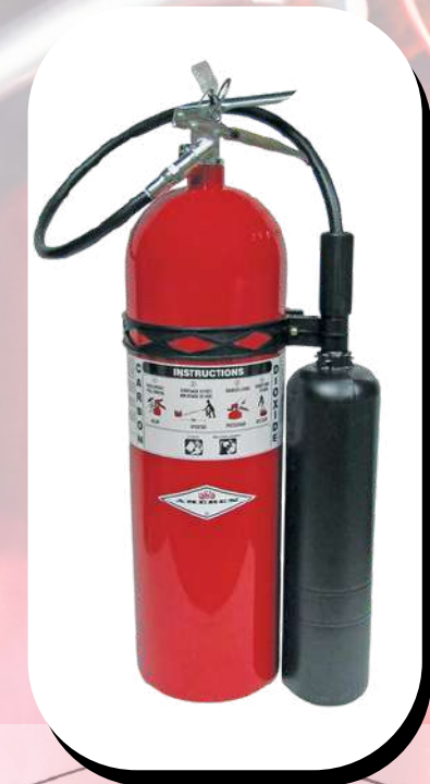
15lbs CO2 model 331