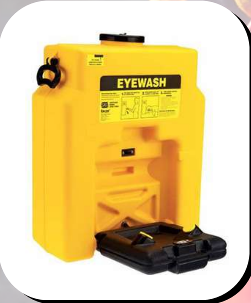
ENCON 01104050 Gravity Fed Eyewash