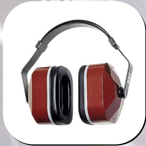
E-A-R™ Model 3000