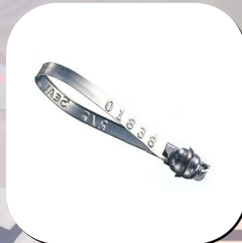
Tyden Ball Seal