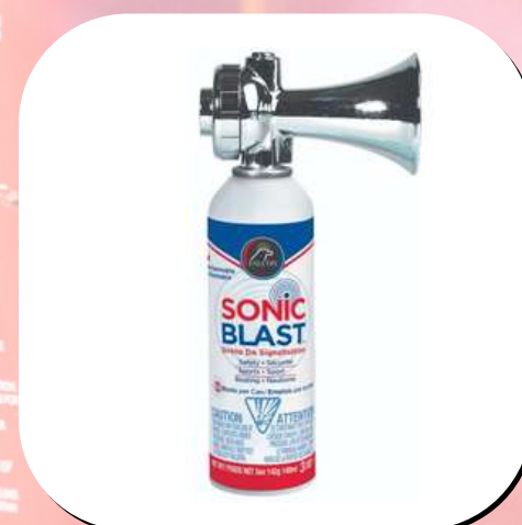
FSB5C SONIC BLAST