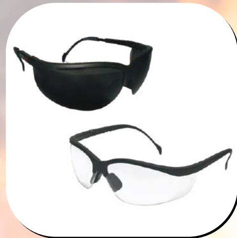
Eyevex SSP 542