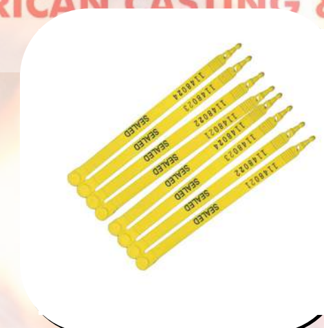
Plastic Seal yellow