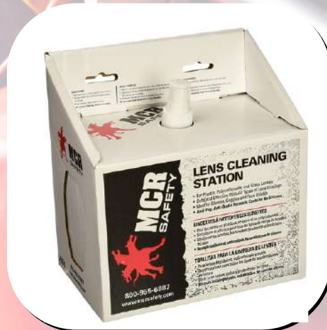
MCR Lens Cleaning Station