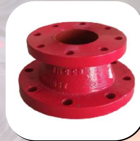
Concentric Reducer P/N: DFRS0604