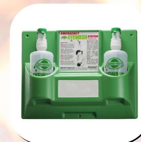
Bel-Art Emergency Eye Wash