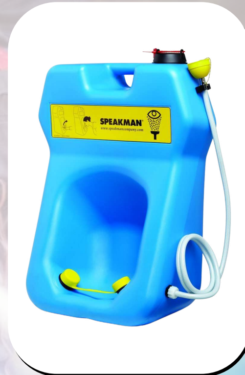
SE-4300 Gravity Fed Eyewash