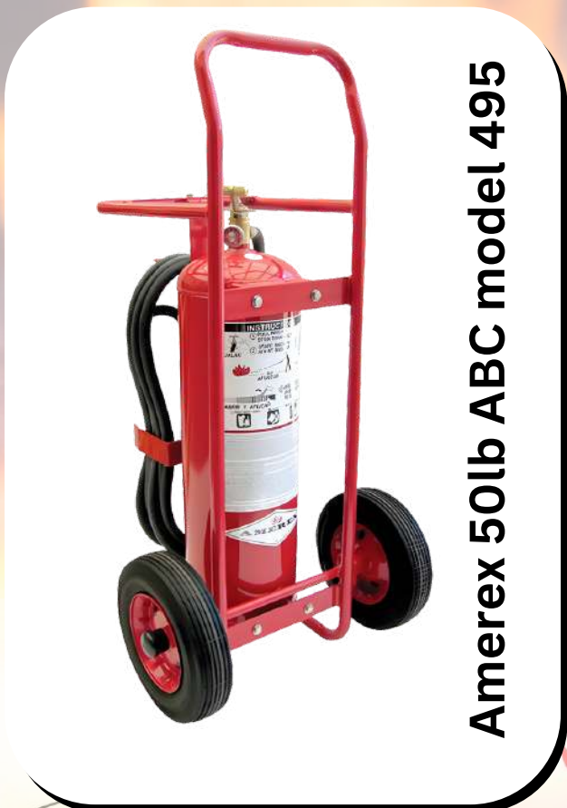
Amerex 50lb ABC model 495