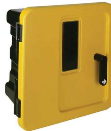
Encon 01338002 Utility Respiratory Wall Case