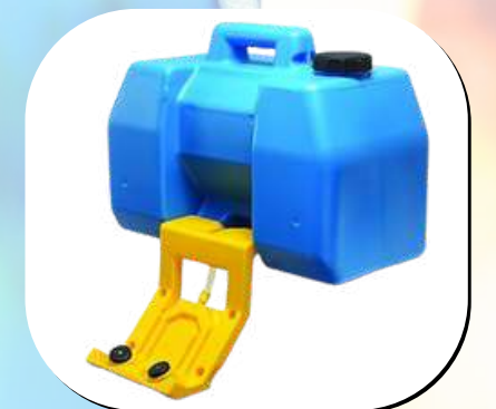
Speakman GravityFlo SE-4400