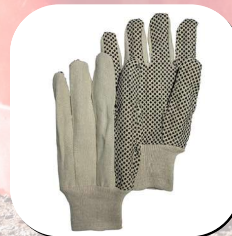
Dotted Cotton Gloves