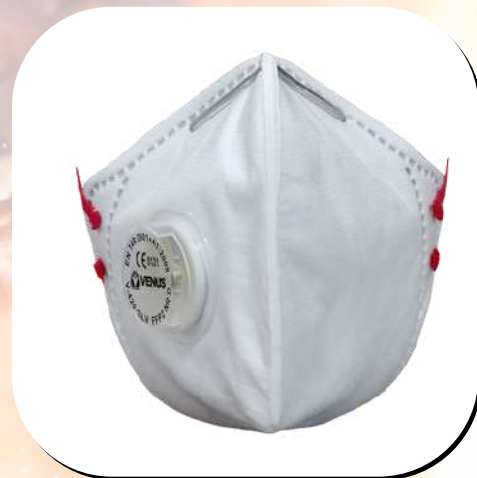
Venus V 420 SLV