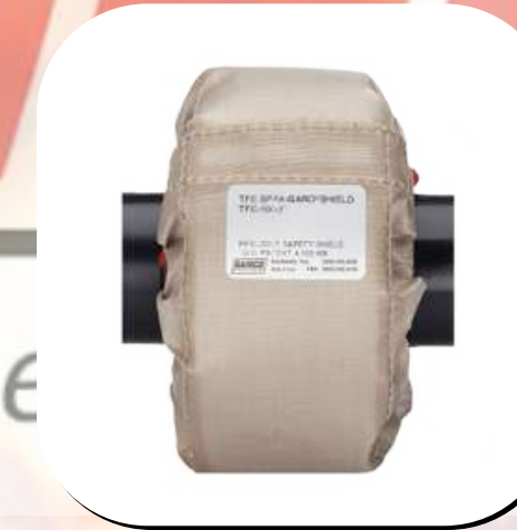
TFE SPRA-GARD® - Size: 6" Flanges Corrosion Protection