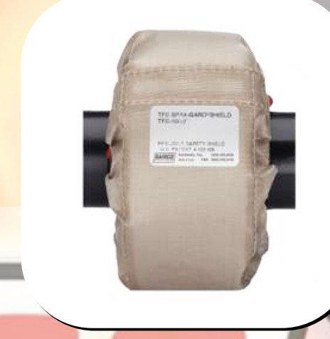
TFE SPRA-GARD® - Size: 2" Flanges Corrosion Protection